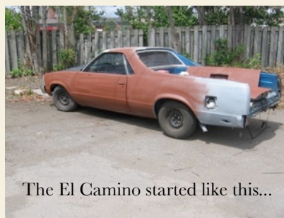
The El Camino started like this...